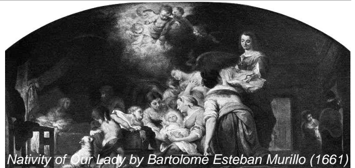
Nativity of Our Lady by Bartolomé Esteban Murillo (1661)

This image of the Nativity of Our Lady by Spanish artist Bartolomé Esteban Murillo (1617-1682) was painted for the Chapel of the Immaculate Conception in Seville Cathedral. It now hangs in the Louvre, Paris. The image clearly illustrates the holiness of Mary's state at birth, being free from original sin from the moment of her conception. To the left of the image Mary's mother, St Anne , rests after giving birth with her husband, St Joachim by her side, while a midwife tends to the newly born Mary in the centre of the image , and Andalusian peasant helpers and angelic beings look on in wonder.