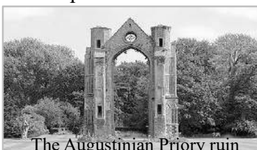
The Augustinian Priory ruin

The story of the Walsingham Shrine begins in Saxon times. In 1061, the Lady of the Manor, Richeldis de Faverches, was taken in spirit to Nazareth, shown the house where the Annunciation took place and asked by Our Lady to build a replica in Norfolk. She was promised that 'Whoever seeks my help there will not go away empty-handed.' The simple wooden house that she built soon became the focus of special devotion to Our Lady. The 'Holy House' was later encased in stone to protect it from the elements.