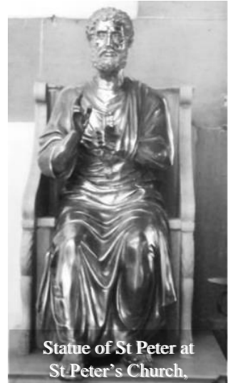
Statue of St Peter at St Peter's Church, Scarborough